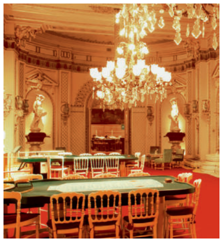
The noble and classic ambiance conceal the ultra-modern processes and secure infrastructure. The system solution from Interflex makes its contribution in this regard.

The transparency and up-to-dateness of the data was thus considerably improved and all paper was eliminated from the work time control process.