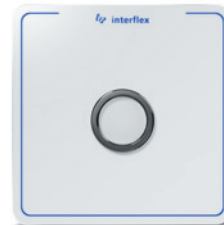
Access control terminal in white